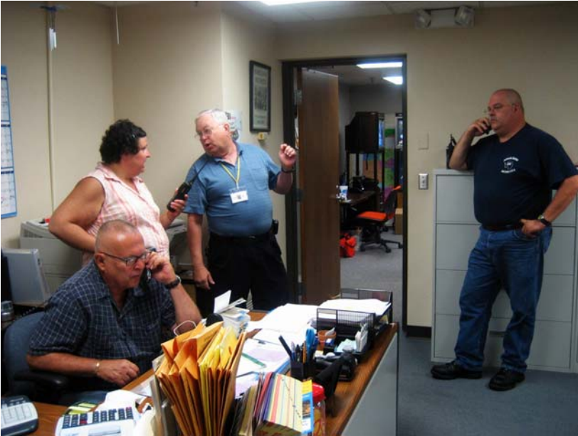
Some of the action in the Johnson County EOC.