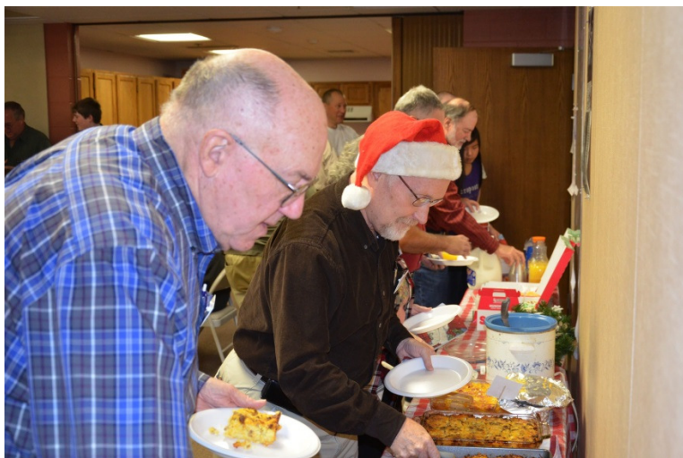
2012 Breakfast Feast