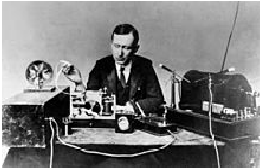
Marconi using his long distance radio cir. 1901.